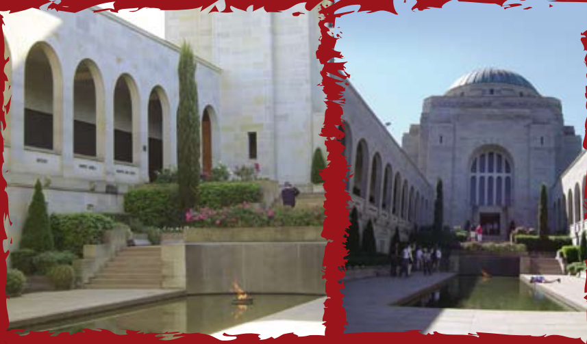
Australian War Memorial

In the words of the Second Vatican Council: