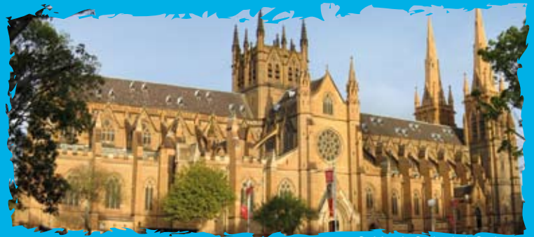
St Mary's Cathedral, Sydney

Upon arrival in Sydney, all the Australian and international military pilgrims will be guests of the Australian Defence Force. The Australian Defence Force will provide accommodation close to the city, meals, transport and medical support. Pilgrims will join with over half a million fellow Catholics in celebrating Our Lord's love and proclaiming the Holy Spirit at World Youth Day Sydney 2008.