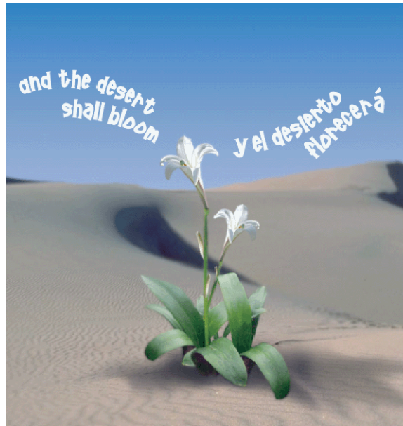
National Conference on Catholic Youth Ministry November 30 – December 3, 2006 Las Vegas, Nevada